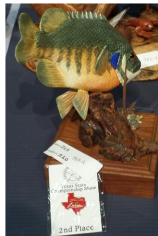
Wanda Reichert's Fish