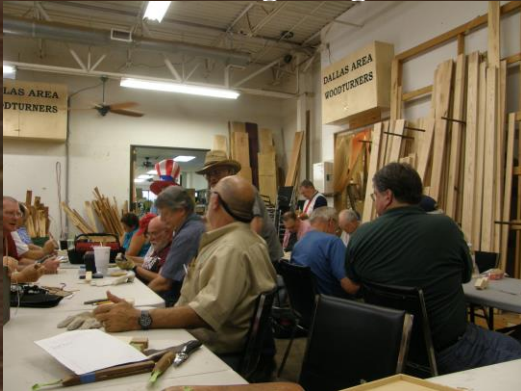
The July Meeting

"TO PROMOTE, PRESERVE, AND PERPETUATE THE ART OF CARVING"