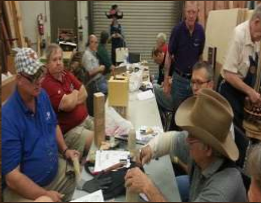
Members at the June Meeting

“TO PROMOTE, PRESERVE, AND PERPETUATE THE ART OF CARVING”