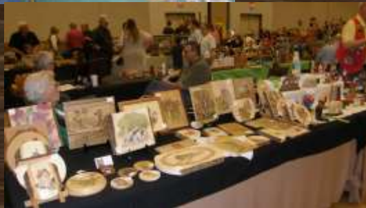
Amazing Woodburnings (Below)