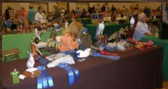
More Awe-Inspiring Carvings!