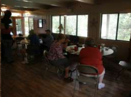
Taken at the Picnic ☺

"TO PROMOTE, PRESERVE, AND PERPETUATE THE ART OF CARVING"